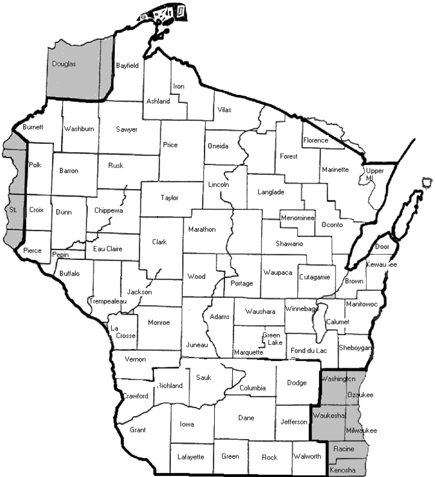
EXHIBIT A – JURISDICTION